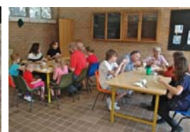
A chit-chat and snag