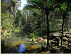
Darling Mills Creek

"The bushland of the Darling Mills Valley is of regional conservation significance as it includes plant communities and species which are of restricted distribution in western Sydney. It is an important habitat for an unusually high number of plants which are inadequately conserved in western Sydney."