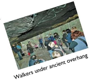
Walkers under ancient overhang

kers saw many plants used by Aboriginal people in their daily life and crossed the creeks that would have been home for many native species such as yabbies, eels, bidjiwong and platypus.