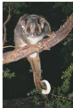
Common Ringtail Possum ( Pseudocheirus peregrines ).

They are treasures because they are one of the most important items in the diet of the Powerful