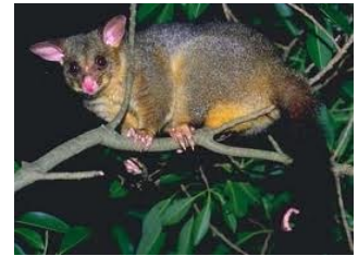
Brushtail Possum ( Trichosurus vulpecular)