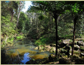
Darling Mills Creek

"The bushland of the Darling Mills Valley is of regional conservation significance as it includes plant communities and species which are of restricted distribution in western Sydney. It is an important habitat for an unusually high number of plants which are inadequately conserved in western Sydney."